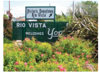
Town entrance sign welcomes visitors to Rio Vista.

Even though everyone in the community was affected by the downturn, many residents, especially older adults, began to increase their volunteer activity and engagement in local youth and general city maintenance activities. According to City Treasurer Hale Conklin, "the City has saved over $10,000/year in