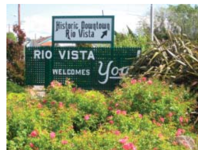
Town entrance sign welcomes visitors to Rio Vista.

Even though everyone in the community was affected by the downturn, many residents, especially older adults, began to increase their volunteer activity and engagement in local youth and general city maintenance activities. According to City Treasurer Hale Conklin, "the City has saved over $10,000/year in